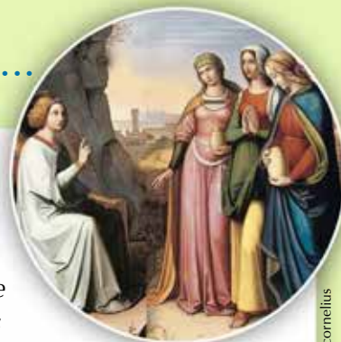
Peter von cornelius